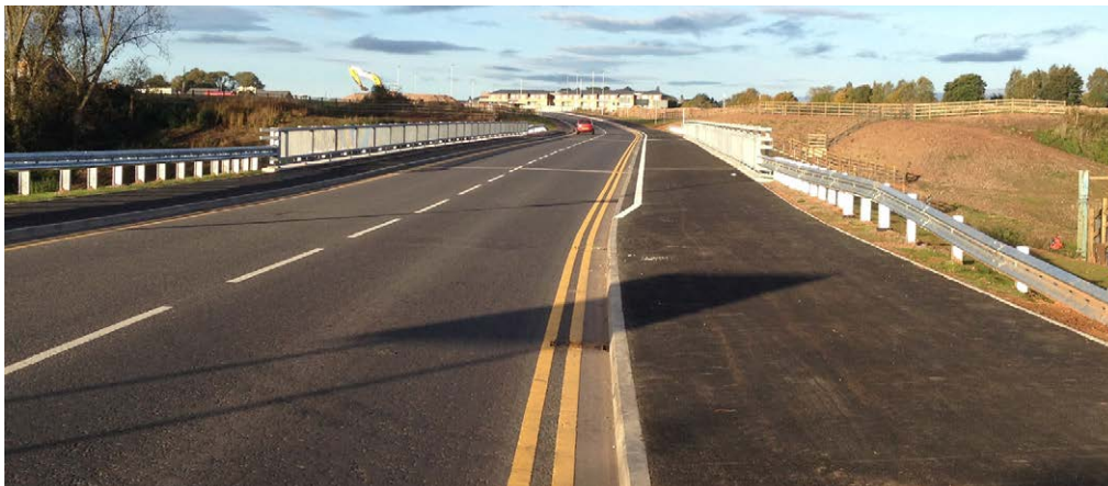
Hoobrook Link Road