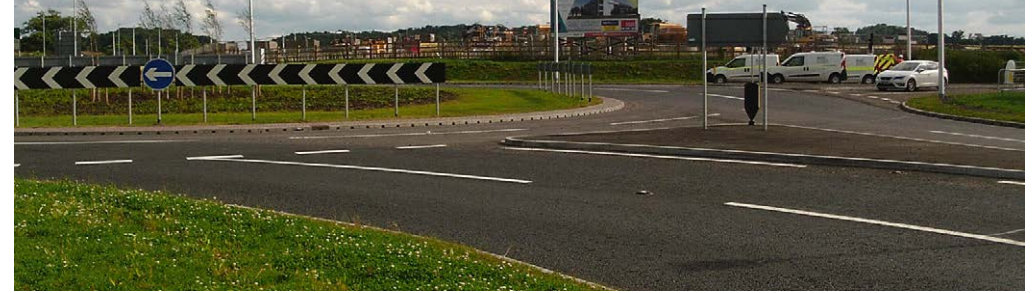
Worcester Six highway works

The performance of the transport network influences the Worcestershire economy, environment and the quality of life that people enjoy; enabling residents to access the services and facilities they need to enjoy a high quality of life. Businesses rely on this network to provide access for employees and to enable rapid movement of freight, providing access to raw materials and delivery of finished products. This plan focuses on delivering cost effective improvements which will maximise the efficiency of the existing network, supporting the local economy and the environment.